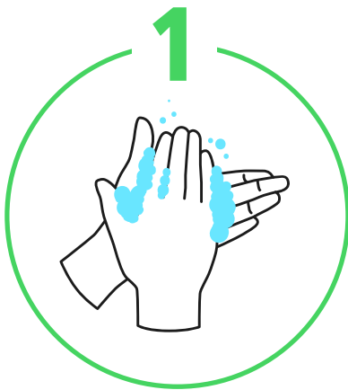
Palm to palm

Wash your hands with soap and water more often for 20 seconds