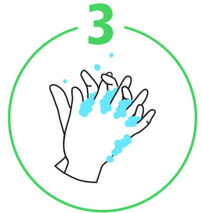
In between the fingers