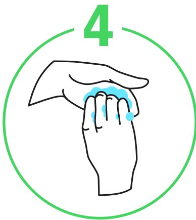
The back of the fingers