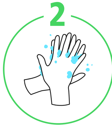
The backs of hands