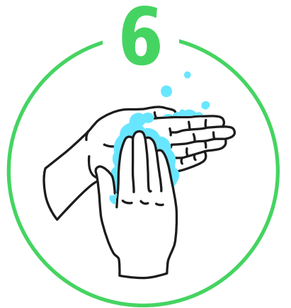
The tips of the fingers

Use a tissue to turn off the tap. Dry hands thoroughly.